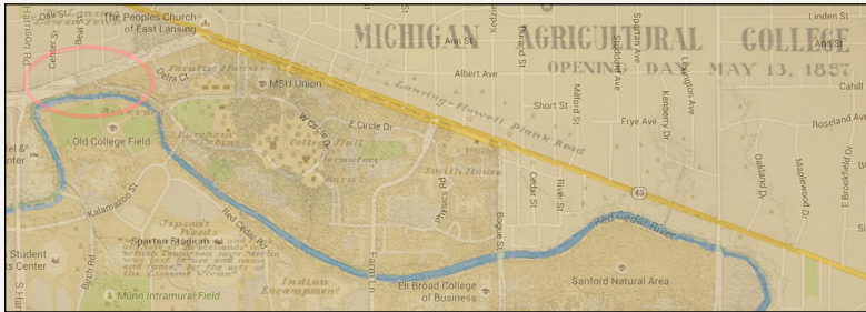
A Michigan Agricultural College map from 1857 overlaid with a modern map of Michigan State University. The circled area indicates the location of the Native encampment in 1857.